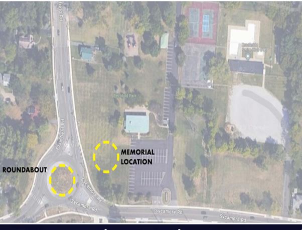
We invite you to become a donor or sponsor of the Sycamore Township Veterans Memorial.

The Sycamore Township Veterans Memorial will be located in the southwest corner of Bechtold Park at 4312 Sycamore Road, at the intersection of Plainfield and Sycamore in Sycamore Township. Entrance to the memorial will be from a sidewalk adjacent to the roundabout at that intersection or from a path inside the park near Bechtold Park Pavilion.